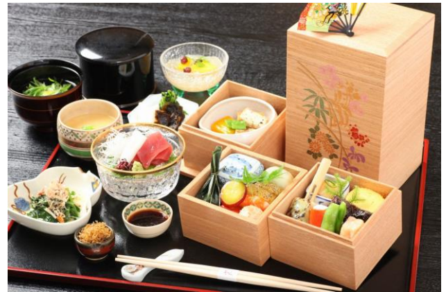
Above picture is just the image of the dishes.