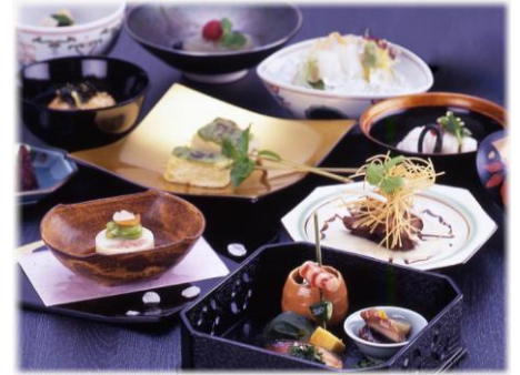
Above picture is just the image of the dishes.

Your memorable stay in Kyoto, how about enjoying Kyo-kaiseki experience ?