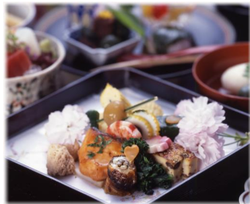
Above picture is just the image of the dishes.